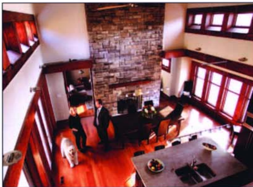
Diane Dickin, Richard Librach in front of the eye-catching fireplace.

Owners aim for perfection to the letter with plan maximizing garden potential Unusual house layout suited to corner lot, allows large interior, exterior spaces