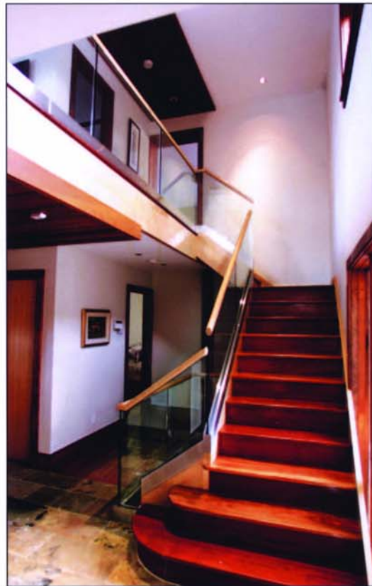
The staircase reflects the open spaces of the L-shaped home.